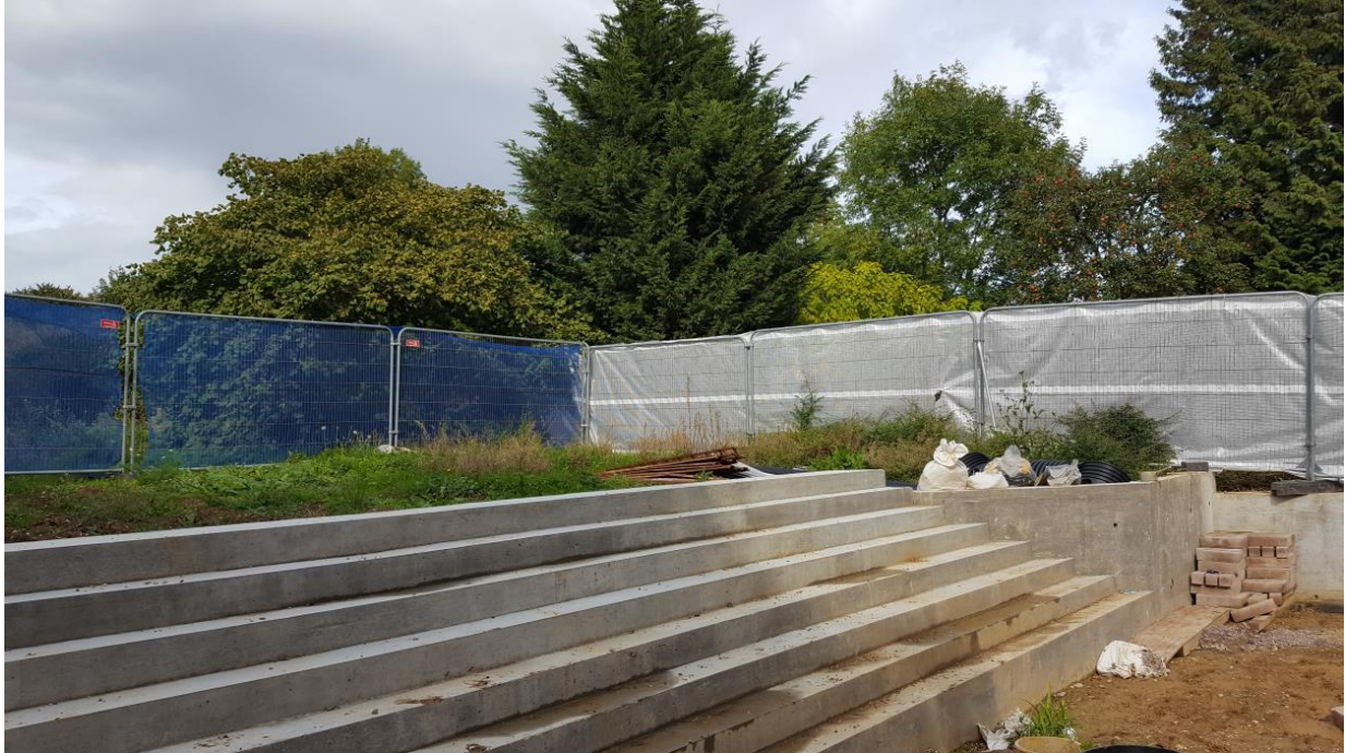
View down the rear garden