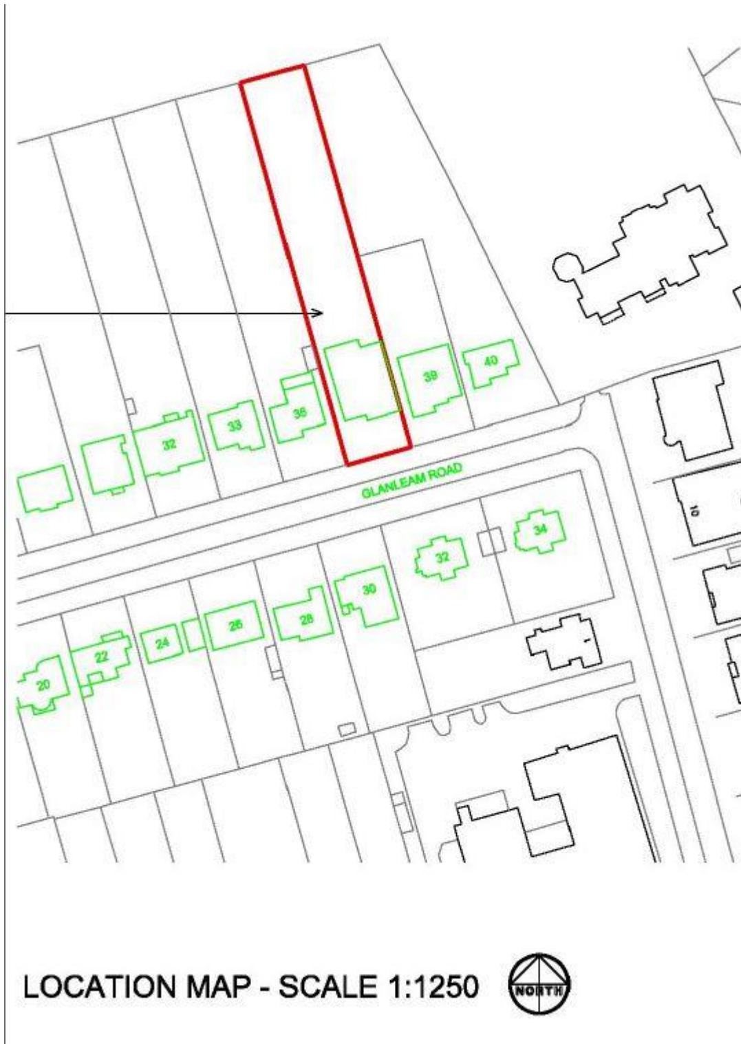
LOCATION MAP - SCALE 1:1250